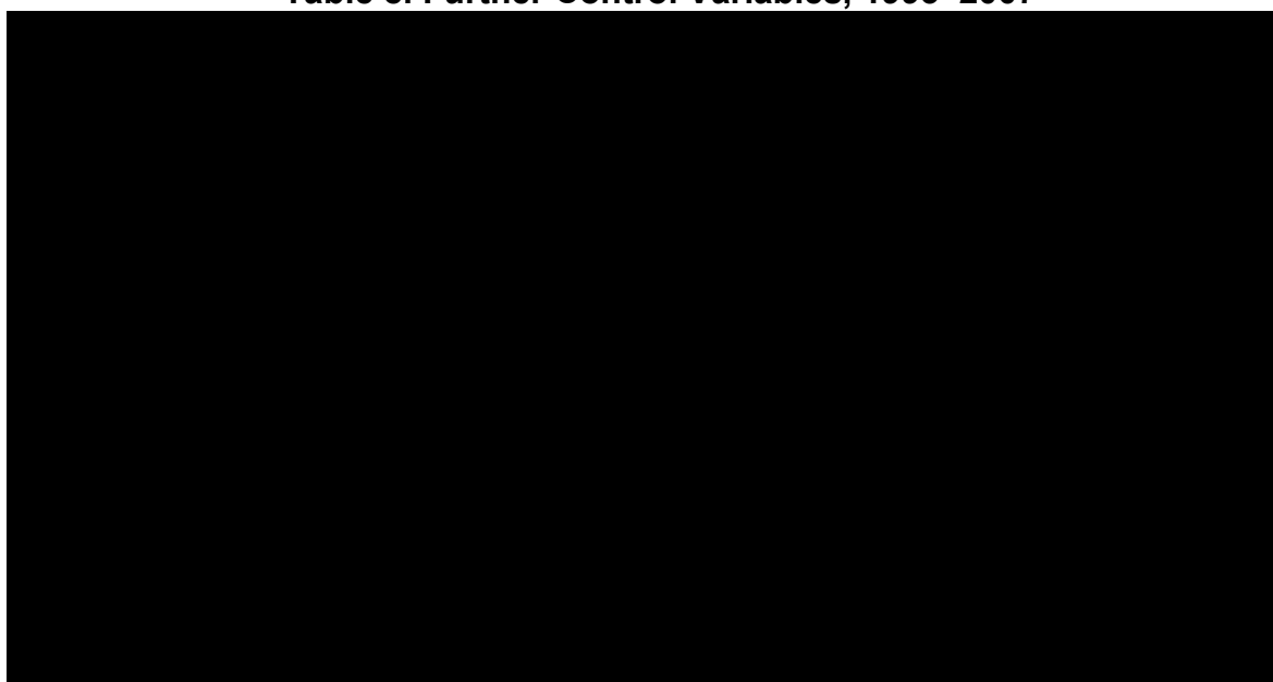
Table 8. Further Control Variables, 1993–2007

Note: Authors' compilation based on Standard & Poor's 2007 and Enderlein, Müller, and Trebesch 2008. For the purposes of this study, defaulters are countries whose governments defaulted on debt obligations toward foreign private creditors between 1980 and 2004 or whose governments arranged a distressed debt restructuring at terms less favorable than the original terms. a Economies included from 1993 on only.