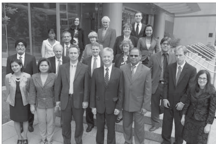
IEO staff and consultants.